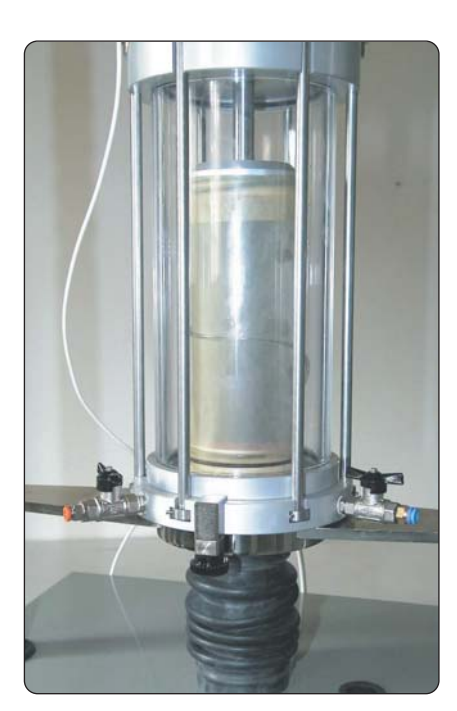
Detail of the locking system of the triaxial cell to the lower platen for extension tests

✓ 28-T0403/A2 Triaxial cell piston for extension tests. It is interchangeable with the standard piston part of 28-T0410/A, 28-T0411/A, 28-T0416/A cells