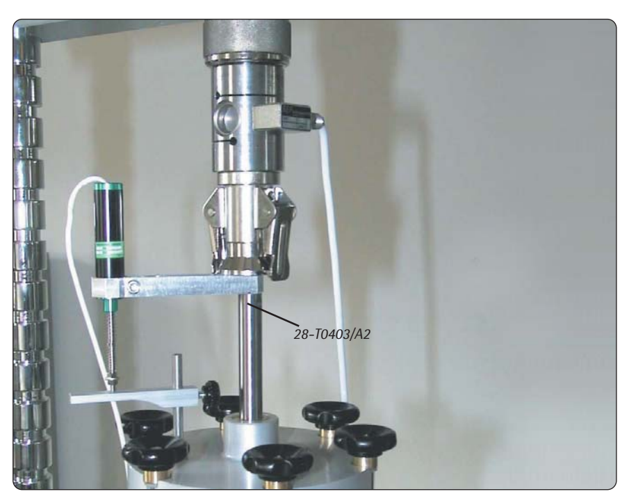
Detail of the triaxial cell and rigid connection to the piston for extension tests