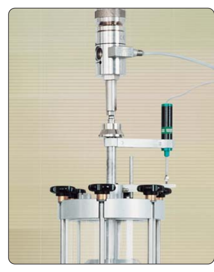
82-P0334 fitted to the triaxial cell by the 28-T1048 mounting bracket and 82-P0370/T load cell fitted to the frame by the spherical attachment

Note. They are connected to the triaxial cell by the accessory 28-T1048.