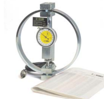
82-T1001/E to 82-T1009/E

28-T1049 Connector with conical seat for load rings. Screwed to the lower base of the load ring to receive the steel sphere. Weight approx. 50 g