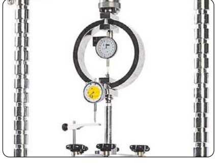
82-D1257 fitted to the load ring

28-T0418/5 Extension rod for application of submersible transducer on triaxial frames (required only for compression tests).